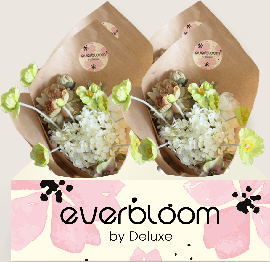
Table display with 4 bouquets – ideal for smaller stores or as a supplement at the checkout.